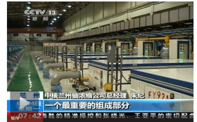
China's Lanzhou Enrichment Plant